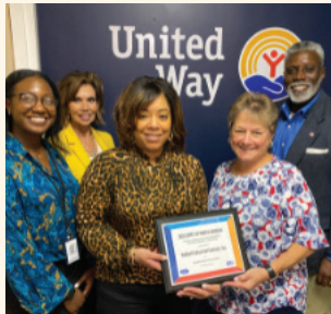
HUBBELL INDUSTRIAL CONTROLS, INC.