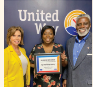
HIGH POINT HOUSING AUTHORITY