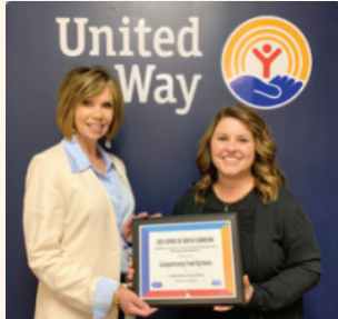
COMPUTERWAY FOOD SYSTEMS INC.

United Way of North Carolina awarded the prestigious Spirit of North Carolina Award to companies and organizations with outstanding United Way campaigns, including some from our community.