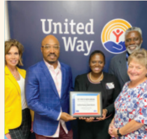
GUILFORD COUNTY SCHOOLS (in conjunction with UWGG)