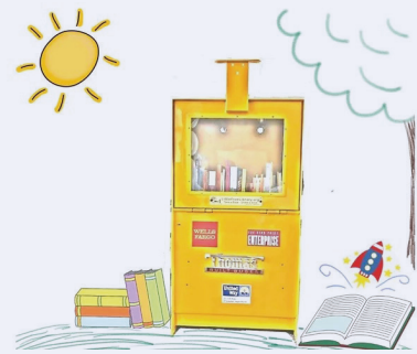
Little Free Libraries

Little Free Library is a free book exchange program as community members can "take a book, return a book or bring a book to share". New and gently used books for children - birth through 10th grade - can be dropped off at the UWGHP office, 815 Phillips Avenue during the week or by placing books in the mail drop at the front of the building. We appreciate the community's support of this vital resource.