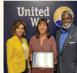
YWCA of HIGH POINT